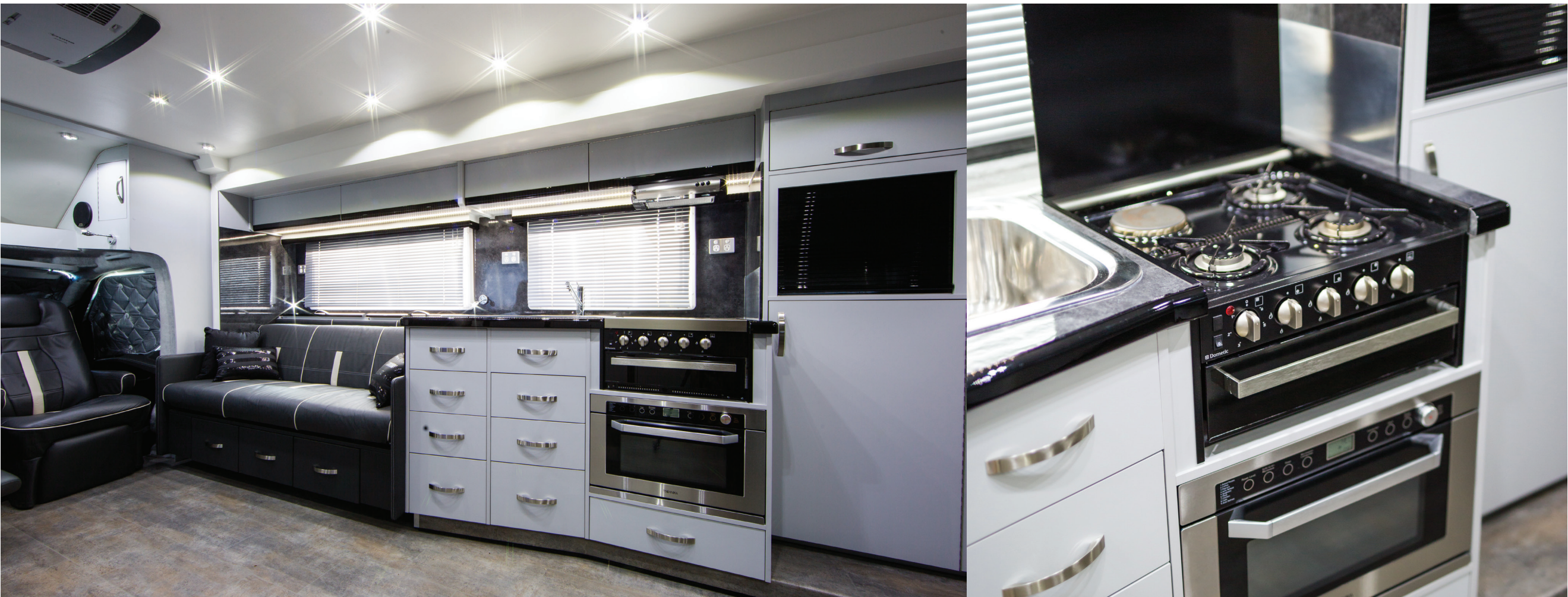
Clockwise from left: There's plenty of room to move in this luxurious motorhome, with a fold out sofa-bed perfect for the kids, or grandkids; electric and gas burners for camping on and off the grid; an external barbecue for happy hour satisfaction; an organised pantry helps at camp.